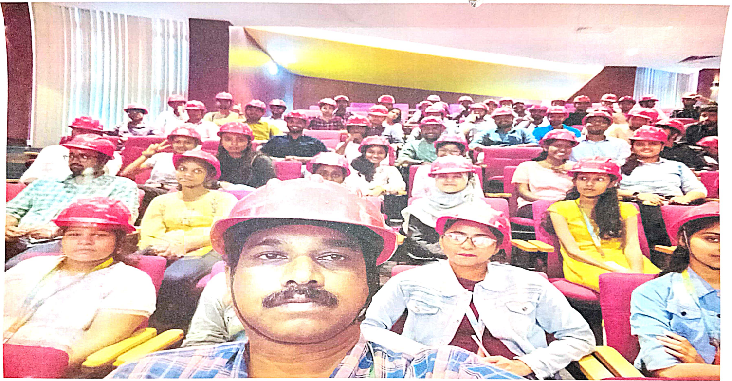
Kirloskar Ferrous Industries Genegari Koppal 6thAug 2022 (at Auditorium-KIFL )