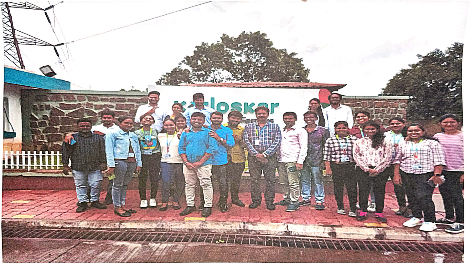
Kirloskar Ferrous Industries Genegari Koppal 6thAug 2022(Main Entrance)