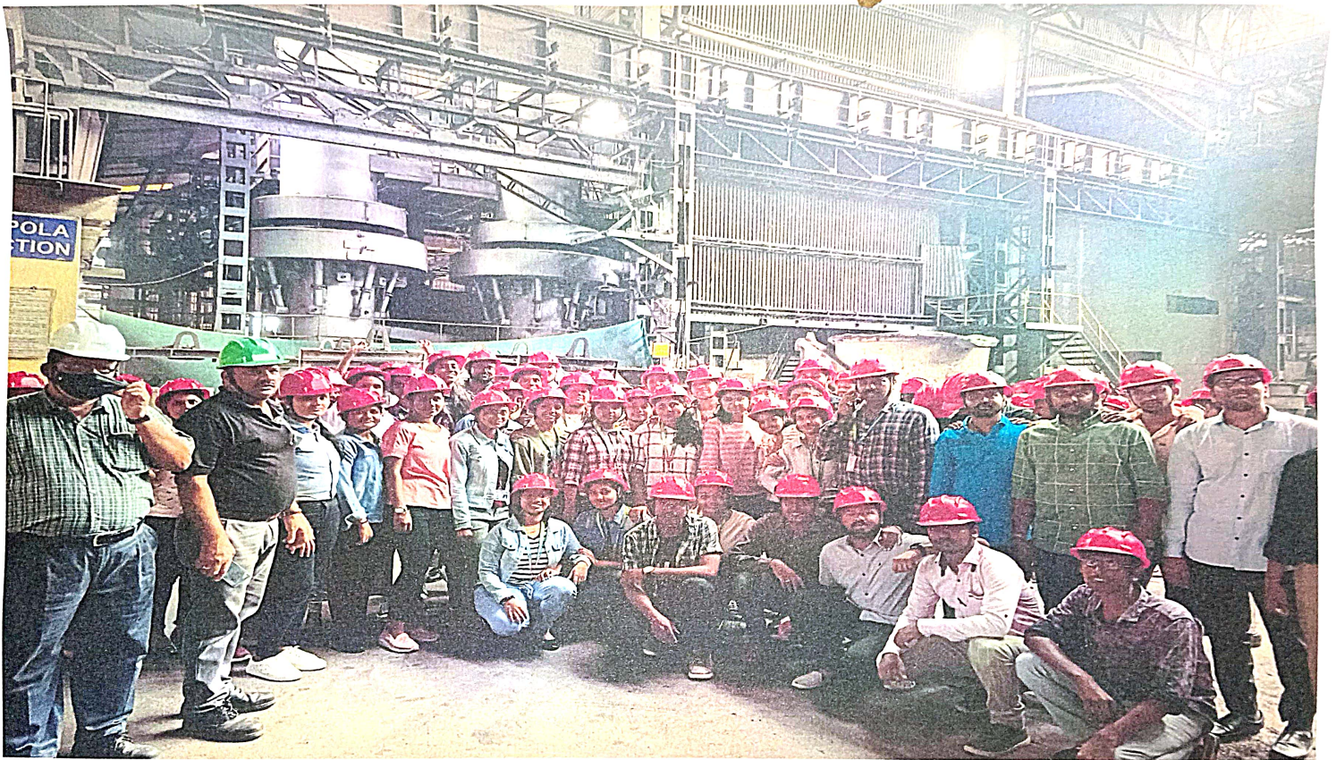
Kirloskar Ferrous Industries Genegari Koppal 6thAug 2022(Blast furnace)