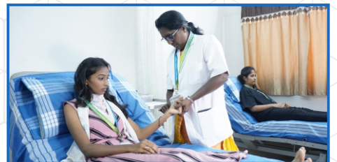
Health Care Centre