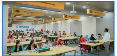
Academic and Research Labs