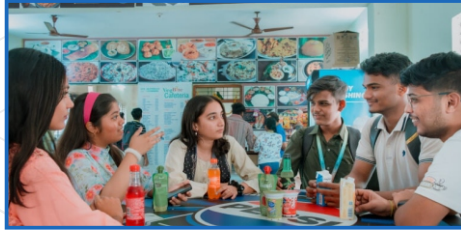
Multi Cuisine Cafeteria