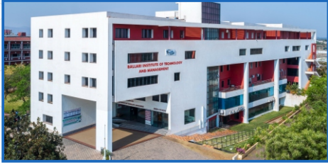
World Class Infrastructure