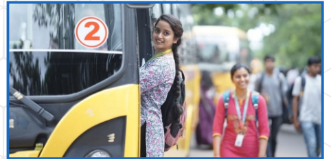
Safe Transport and Convenience