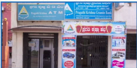
ATM & Banking Facility